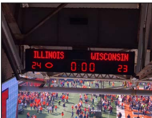
Alumni revel in one of the most exciting Illini football games to date (breaking news the Michigan State comeback of late is as good or better)