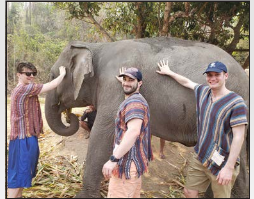
Playing with elephants at an ethical elephant adventure in Thailand.