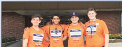
After eight hours of helping freshmen move in, we, the brothers of KΔP, came together for a photo.

We here at Eta have our biggest event: Car Bash! This event is our largest fundraiser, filled with food, music, and fun. All the proceeds go toward the Andrew McDonough B+ Foundation. Last year, we raised more than $2,000. Our goal this semester is to raise $3,000.