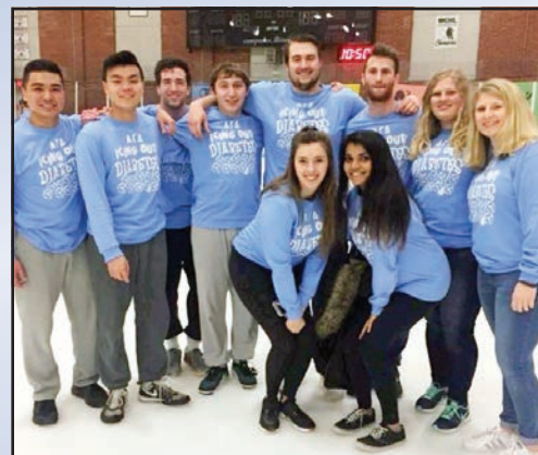
KAP's broomball team for AΓΔ's Icing Out Diabetes.