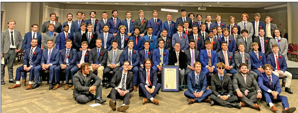
Kappa Chapter at Ohio State chartering.

NU GAMMA CHAPTER The College of New Jersey