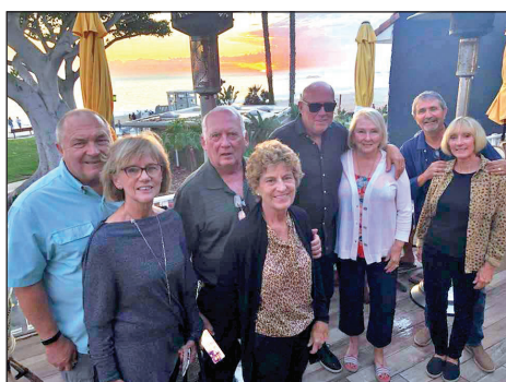
KAP's in California at Laguna Beach.