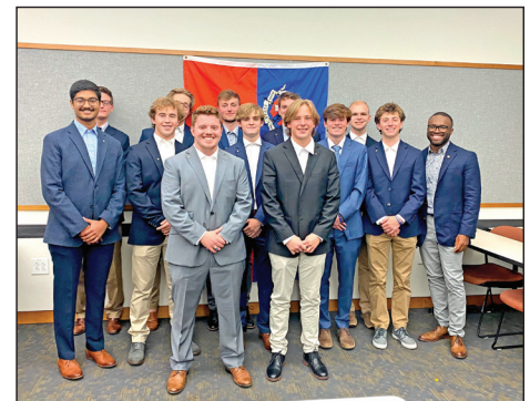
Virginia Tech Gamma Beta recolonization begins.