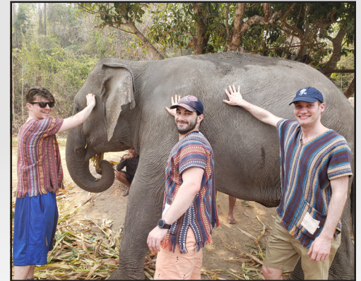
Playing with elephants at an ethical elephant adventure in Thailand.