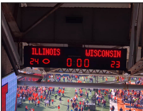
Alumni revel in one of the most exciting Illini football games to date (breaking news the Michigan State comeback of late is as good or better)