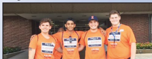
After eight hours of helping freshmen move in, we, the brothers of KΔP, came together for a photo.

We here at Eta have our biggest event: Car Bash! This event is our largest fundraiser, filled with food, music, and fun. All the proceeds go toward the Andrew McDonough B+ Foundation. Last year, we raised more than $2,000. Our goal this semester is to raise $3,000.