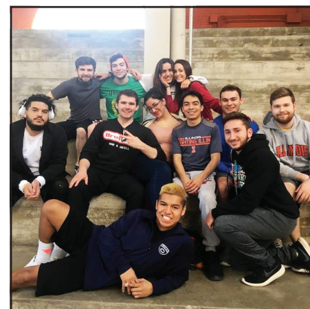
KΔP men participating at Kappa Delta's dodgeball philanthropy.