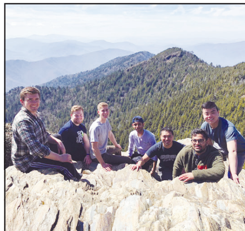
The gentlemen of Eta scale the Smoky Mountains.