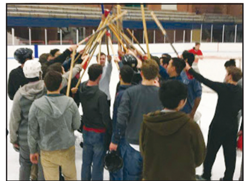
Men of KDP after a night of playing broomball. At the end, we joined together and chanted KDP!