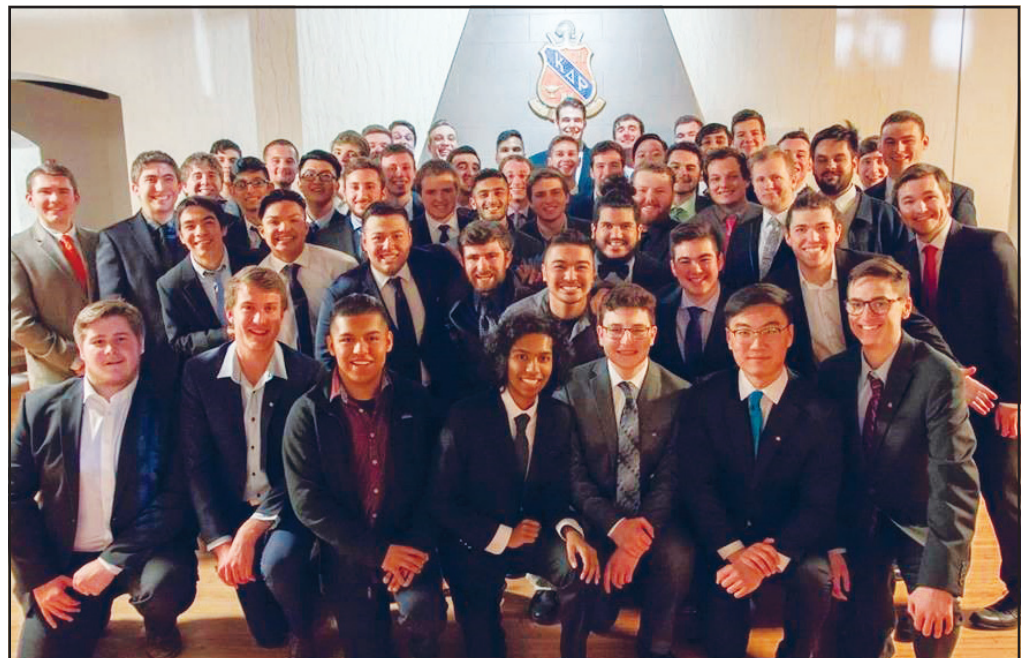
KDP's spring class (front row) and the rest of the chapter behind them.

To check your information, go to www.kdrillinois.org and log in.