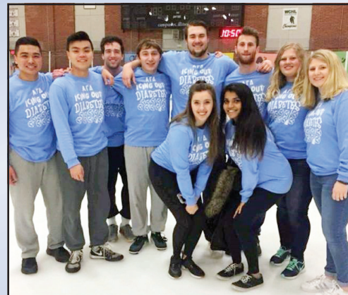
KDP's broomball team for AFD's Icing Out Diabetes.